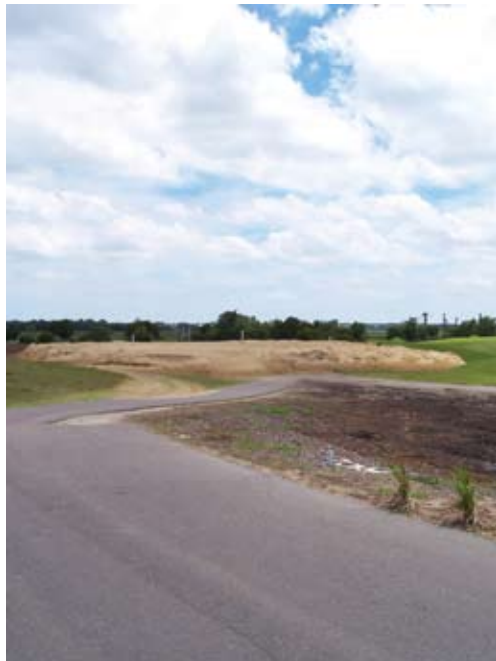
The clubhouse site is filled with dirt, awaiting the completion of soil testing.

The Guardhouse has all of the structure now in place. The high roof line and walls have been covered. The exterior cedar / shake shingles have made the building quite special. The copper roof ties in with our original designs and looks fantastic. The interior finish and utility lines should be complete and the building ready for occupancy in mid-July.