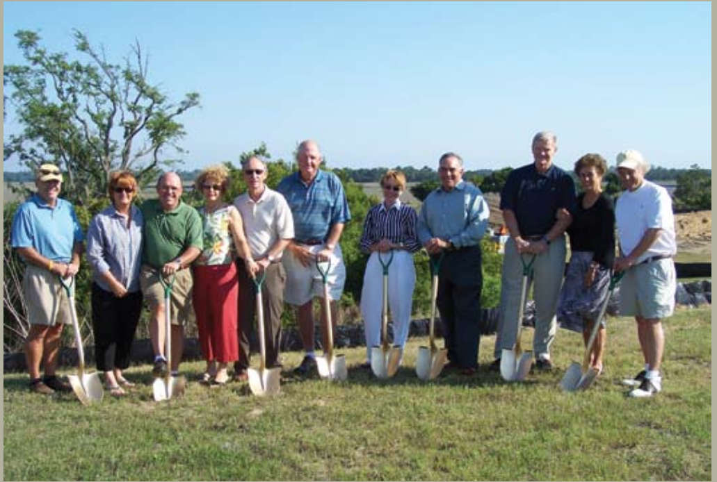
Founders in attendance put a shovel in the ground to commemorate the occasion.