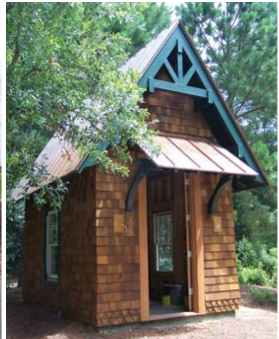
The guardhouse at the front entrance is expected to be completed in mid-July.

CAUTION: Again we ask that you use good judgment around both projects. We'll appreciate your patience.