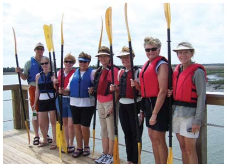
Members line up for the Spring Kayaking Outing on Briar's Creek.

Enjoying this lifestyle does not have to be done in a group event – though it is always fun to do so. Members, their families and their guests can come out and walk the 2 mile nature trail around Lake Sharon and through the Wildlife Sanctuary at any time; fish for an abundance of Large-mouth Bass, paddle a canoe up the lake, or take a picnic lunch up to the top of the elevated area overlooking the 53 acre lake. You can golf with your friends any day, and live the lifestyle of Briar's Creek every day.